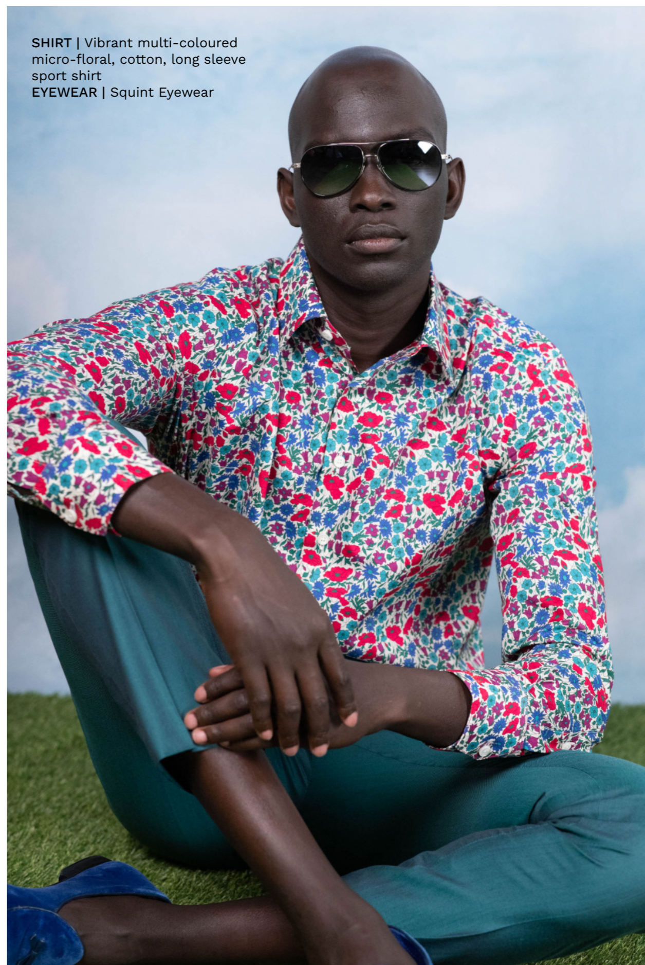
SHIRT | Vibrant multi-coloured micro-floral, cotton, long sleeve sport shirt EYEWEAR | Squint Eyewear