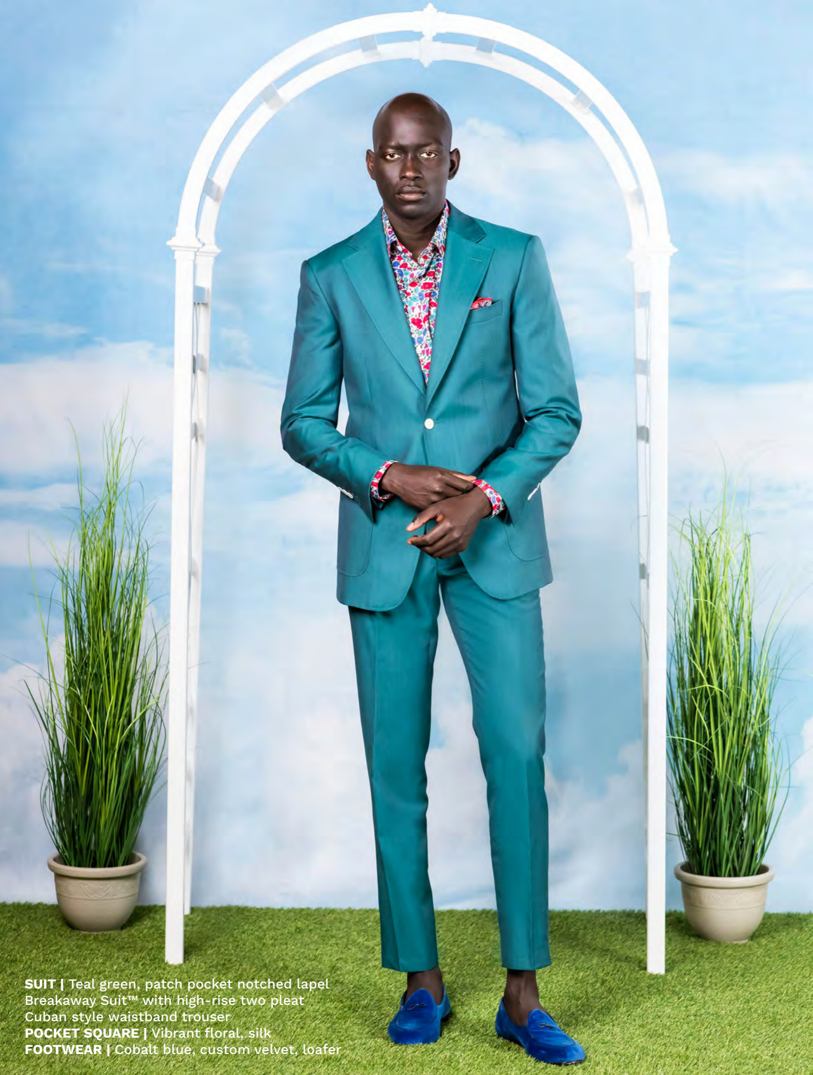
SUIT | Teal green, patch pocket notched lapel Breakaway Suit™ with high-rise two pleat Cuban style waistband trouser POCKET SQUARE | Vibrant floral, silk FOOTWEAR | Cobalt blue, custom velvet, loafer