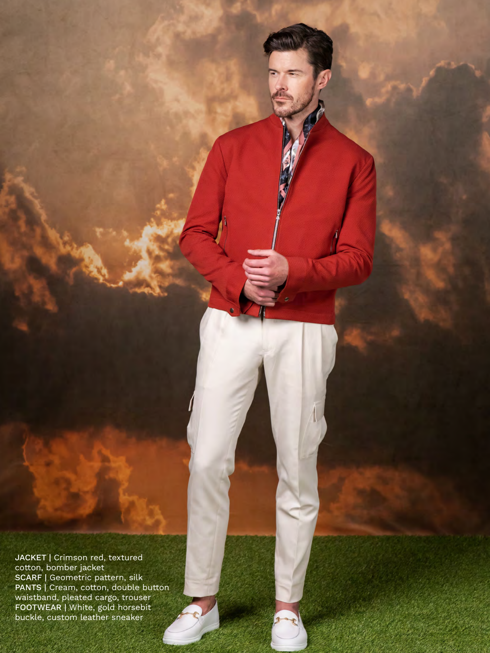
JACKET | Crimson red, textured cotton, bomber jacket SCARF | Geometric pattern, silk PANTS | Cream, cotton, double button waistband, pleated cargo, trouser FOOTWEAR | White, gold horsebit buckle, custom leather sneaker