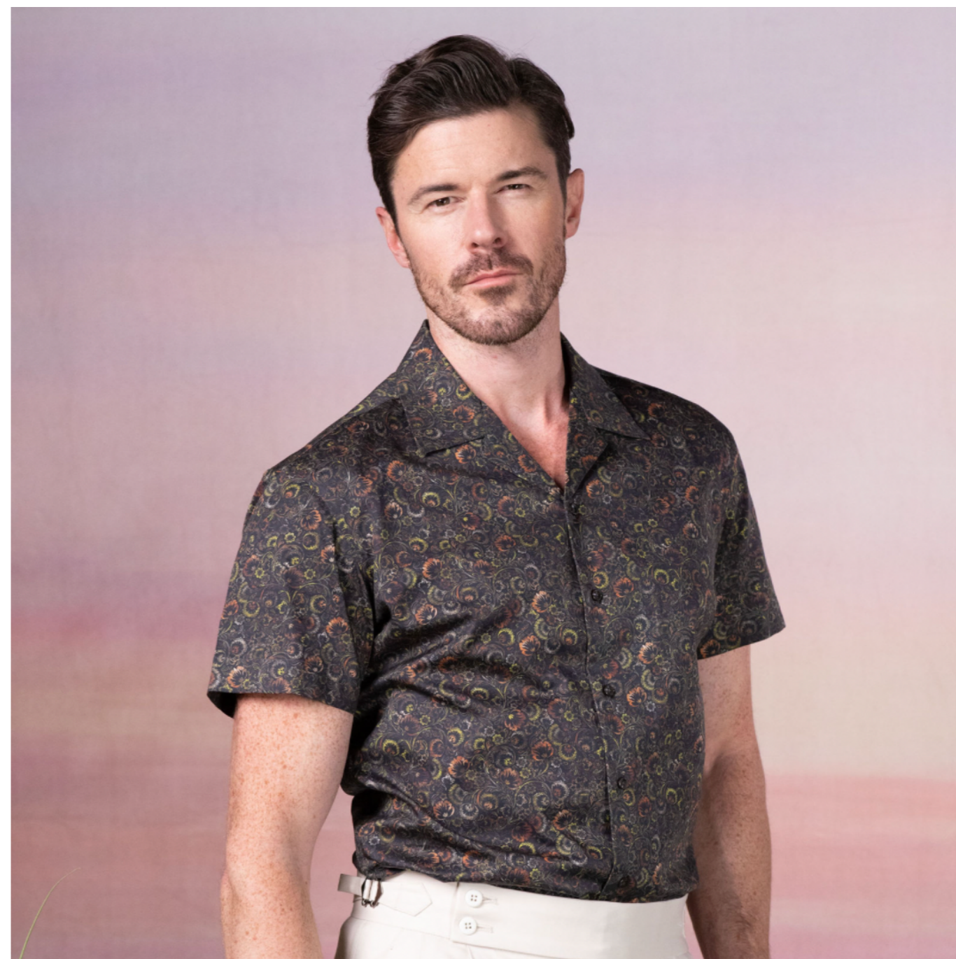
SHIRT | Chocolate brown micro-paisley, Havana collar, cotton, short sleeve sport shirt PANTS | Cream, cotton, double button waistband, pleated cargo, trouser FOOTWEAR | White, gold horsebit buckle, custom leather, Belgian sneaker