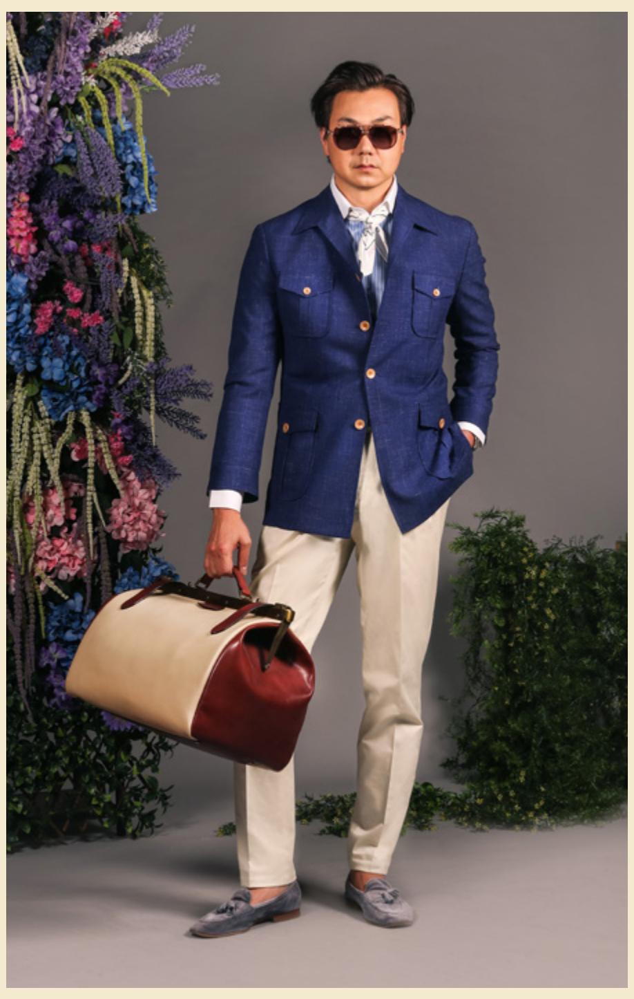
SPRING / SUMMER 2021 LOOKBOOK