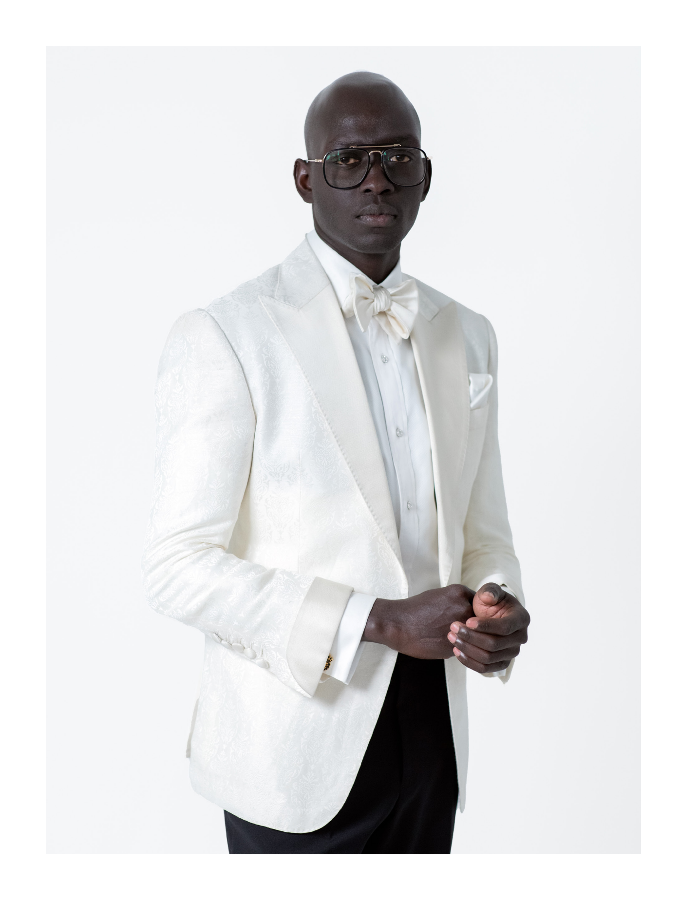
Ivory has been synonymous with weddings for a long time. The first colour that comes to mind when thinking of a wedding is white. Grooms have been opting for a formal Ivory dinner jackets as an alternatives to a black tuxedo to showcase the formality of their big day as well as to stand out from their guests.

Nothing is more timeless than a groom in a formal black tuxedo. As the quintessential evening look, the black tuxedo will stand the test of time and will be as formal today as it will be generations from now.