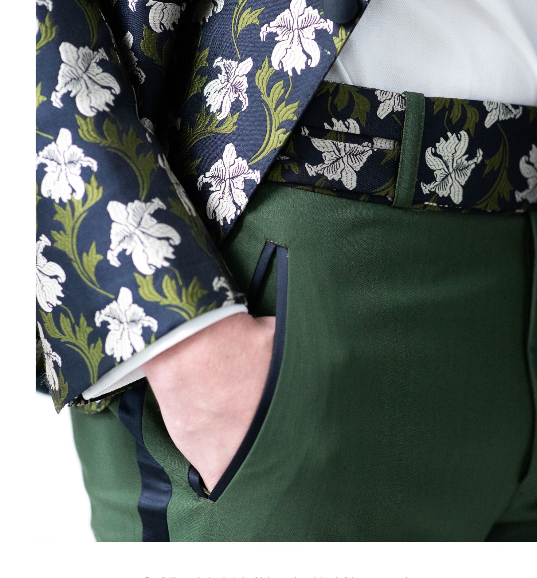
Details like continuing the jacket fabric onto the waistband of the trousers or using the same navy satin lapel trim onto the trim on the pockets and side stripe.

A stand out look is not just about choosing a bold fabric. Design plays a large role in creating the right look. It's the simple details that make the largest impact on this Floral Jacquard Smoking Jacket & Sage Trouser combination.