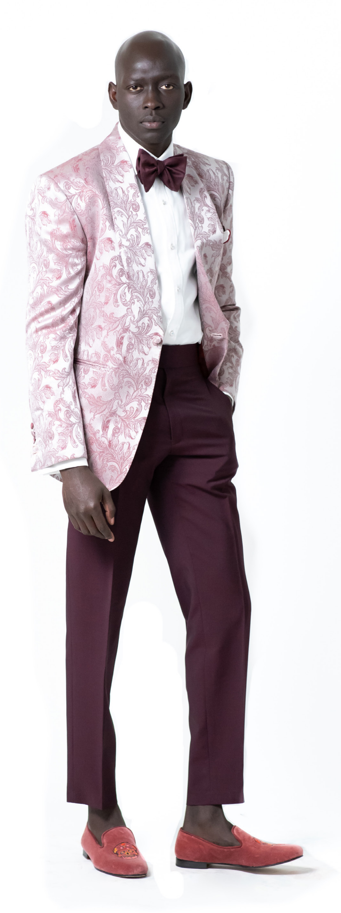
This is an opportunity for grooms to embrace colour into their wedding outfits, enabling them to shine. Which also has an added benefit of working cohesively with the florals, decor and venue of their wedding creating well balanced wedding pictures

Pastel tones are beautiful colour palettes to use for spring/summer formal wear. Normally while traditional formalwear is darker to take advantage of evening lighting, the spring/summer season is known for longer days in natural light. This is an opportunity for grooms to embrace colour into their wedding outfits which can in turn, work cohesively with the florals, decor and venue of their wedding creating well balanced wedding pictures.